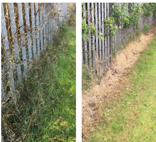
Before and after