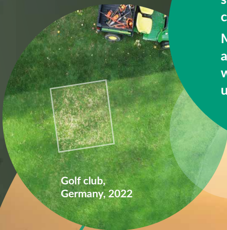
Golf club, Germany, 2022

Maxtima ® at label rate of 1.5 L/ha applied twice showed high disease control of dollar spot.